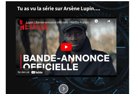
Escape room about Lupin