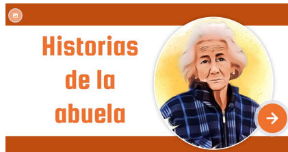
overview of the way of life during the Spanish Civil War