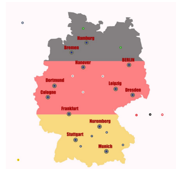
Germany: from north to south